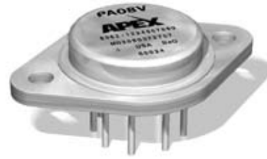
8-PIN TO-3 PACKAGE STYLE CE